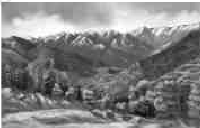
A mountainous region