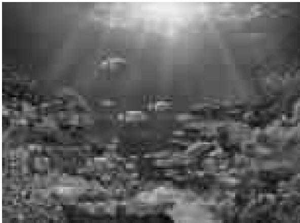
An underwater view of an Ocean

vastness of outer space, from what is cooking in the kitchen to what is happening on the playground, some of the most groundbreaking discoveries have often come from unexpected places.